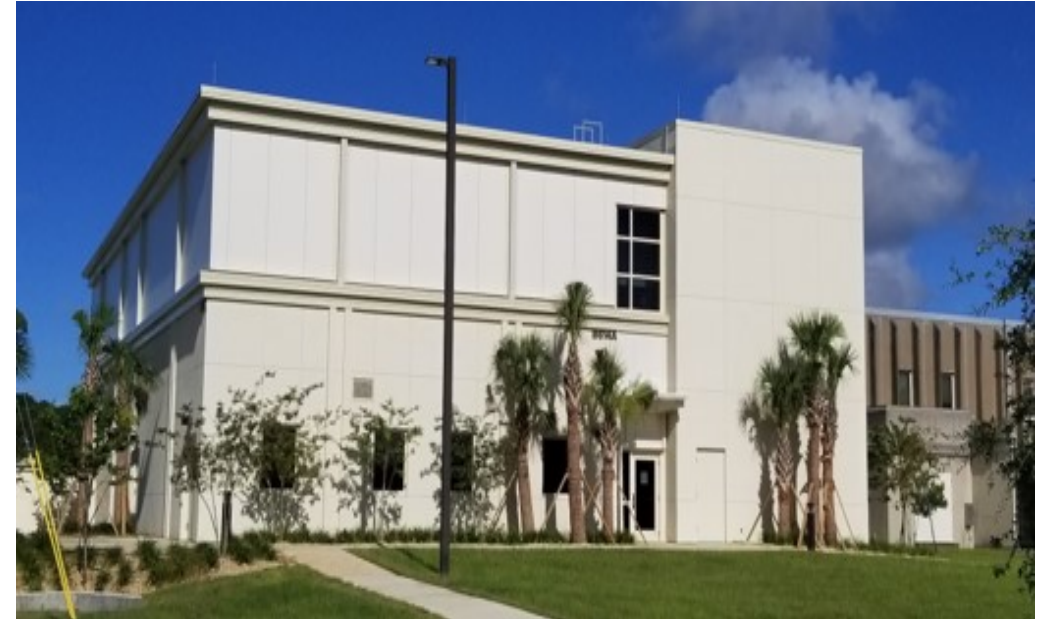
Eglin AFB F35A Armament Research Facility Addition – Small Business Set-aside